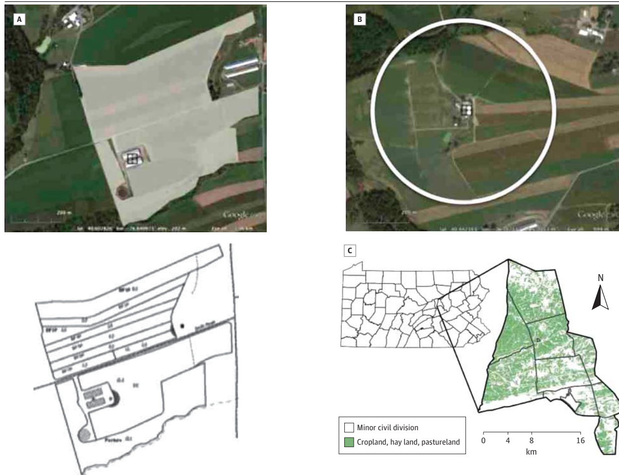
Figure 2. Three Methods Used to Identify and Locate Crop Fields

A, Aerial photograph (top) or map (bottom) were located using Google Earth (n = 135). B, Operation addresses known and located using ArcGIS, version 10 (Esri) (n = 420). C, County and township known and addresses were located by